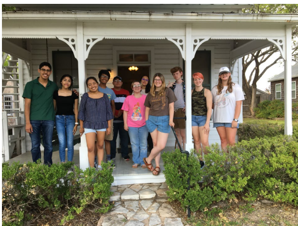
The Student Group Which Filmed in Fredericksburg

This was the most remarkable designation of all, as it was a true intervarsity accomplishment, coming out ahead of university honors students from Nebraska to Texas.