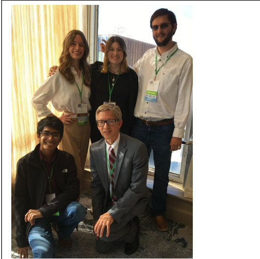
Presenting at the NCHC in Dallas in November of 2022. Our five NTCC Webb members formed one of the 50 general panels of the NCHC, and our session was based on our Texas-based film series.