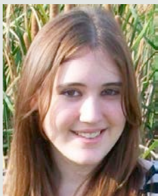
See cast photo on Page 4.

She had to concoct blood, simulate a lynching, produce an applauding crowd out of the thin air and make an unlit fire burn!