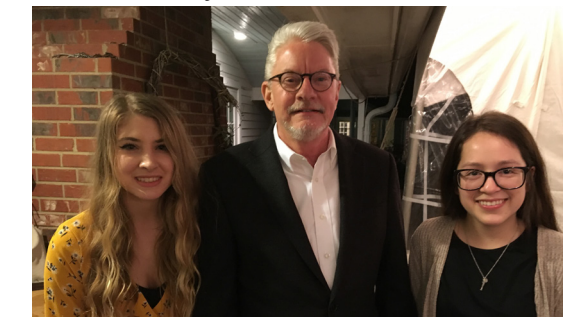
Below, our two JKC winners and President Clinton