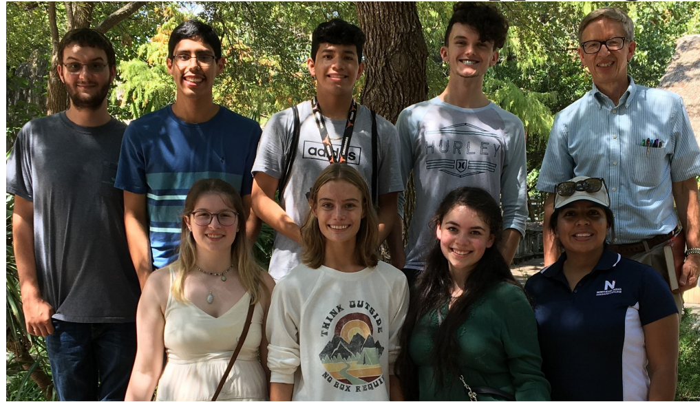
Winners of the 14th Annual Northeast Texas Poetry Contest